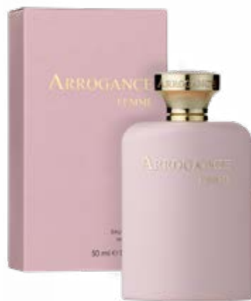
EAU DE TOILETTE SPRAY