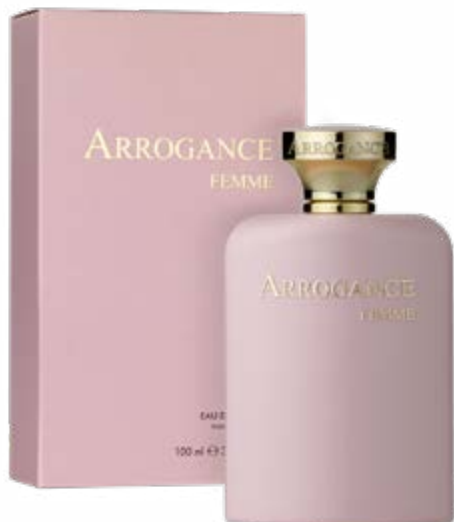
EAU DE TOILETTE SPRAY

Dinamica e indipendente. Consapevole della sua femminilità, la donna che indossa ARROGANCE FEMME vive intensamente ogni momento della giornata, accompagnata dalle note intense e avvolgenti del suo profumo.