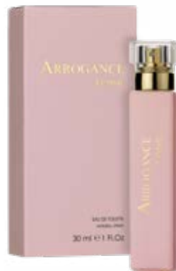
EAU DE TOILETTE SPRAY