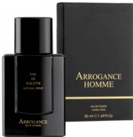
EAU DE TOILETTE SPRAY

Un classico sempre attuale, l'uomo che indossa Arrogance Homme conquista con la sua forte personalità e il suo fascino. Gentleman contemporaneo, apprezza accessori eleganti e ricercati, come il suo profumo senza tempo.