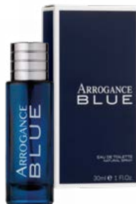
EAU DE TOILETTE SPRAY