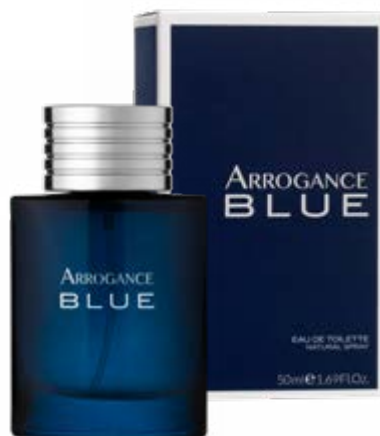
EAU DE TOILETTE SPRAY