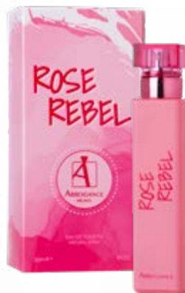
EAU DE TOILETTE SPRAY