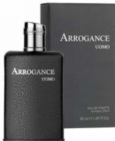
EAU DE TOILETTE SPRAY