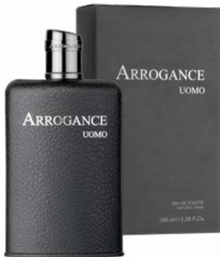
EAU DE TOILETTE SPRAY

Dinamico e sicuro di sé, l'uomo ARROGANCE UOMO affascina con il suo carisma e conquista con esuberanza ed un pizzico di follia. Libero da preconcetti, assapora ogni momento della vita che affronta come un viaggio, accompagnati dagli accordi speziati del suo profumo.