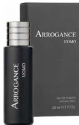
EAU DE TOILETTE SPRAY