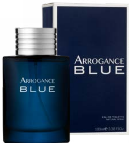
EAU DE TOILETTE SPRAY

Ambizioso, estroverso e brillante, l'uomo che indossa ARROGANCE BLUE ama le sfide, è uno spirito libero che osa con ironia nelle scelte di tutti i giorni: Il profumo, suo irrinunciabile accessorio, con vibrante freschezza esprime al meglio la sua personalità.