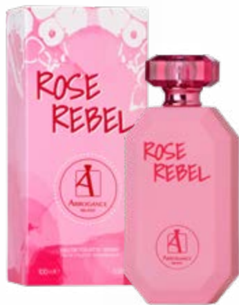
EAU DE TOILETTE SPRAY