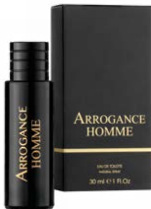
EAU DE TOILETTE SPRAY