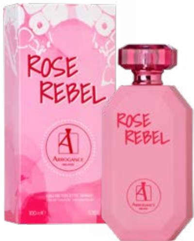
EAU DE TOILETTE SPRAY

Intrigante e dolcemente ribelle, una fragranza dalla personalità forte e sfaccettata. Un tripudio di note fruttate e avvolgenti accordi fioriti da cui spicca l'inedita nota marshmallow, vera protagonista di questo bouquet, suggellato da sensuali note gourmand e legni preziosi.